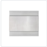
EW6108-BN Brushed Nickel