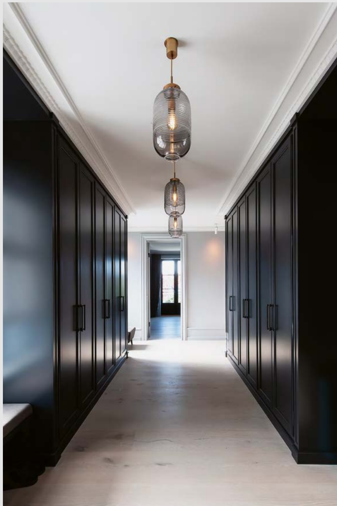
Lantern Collection, Denmark, Interior in cooperation with our partner Anker & Co