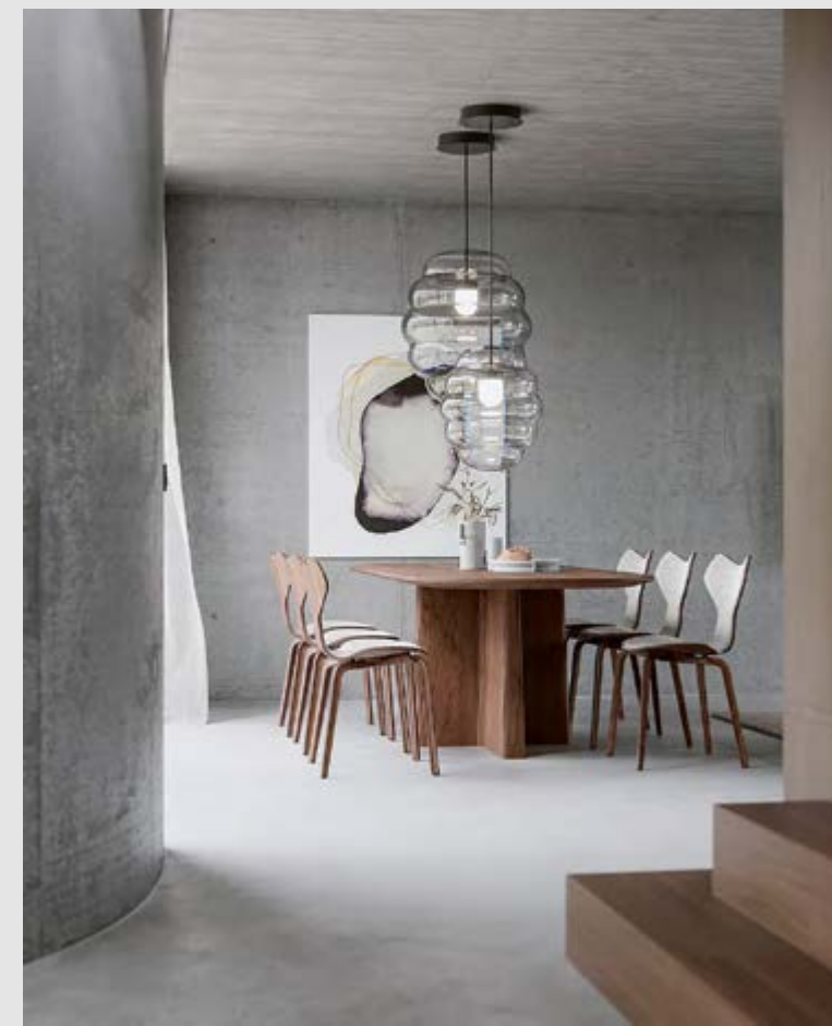
Pyrite Collection, Norway, Interior by Aparta Interior in cooperation with LHM Group