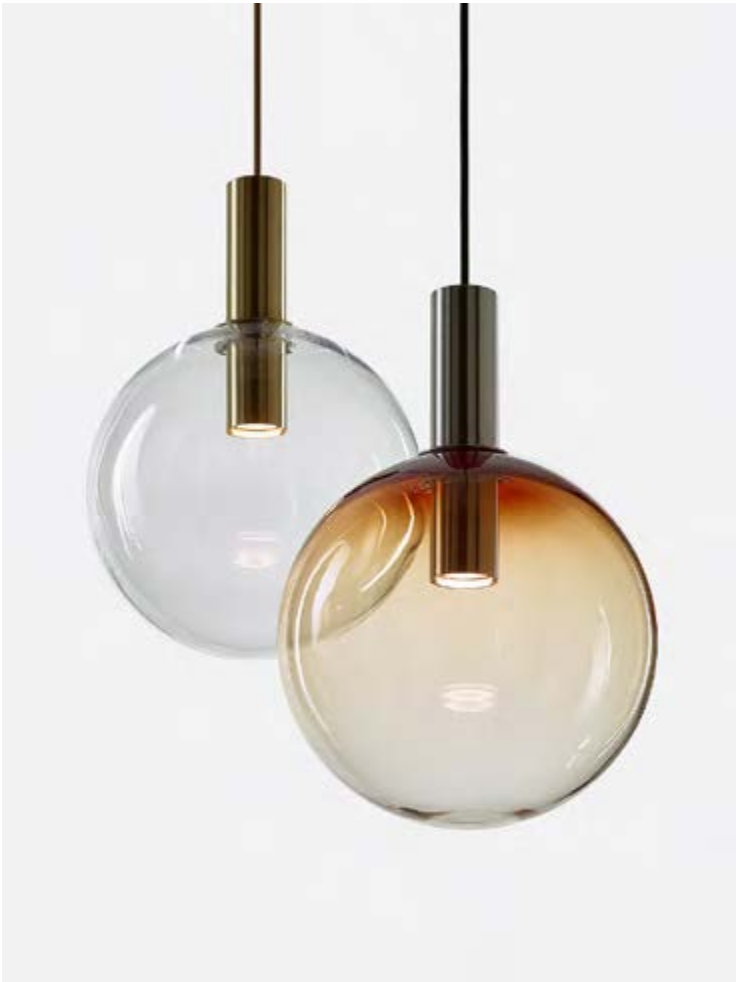
Glass Color: Clear, White, Smoke, Red Orange, Plum Mounting Finish: Brushed Silver, Brushed Gold