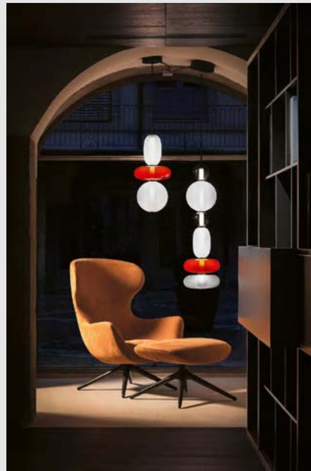
Pebbles Collection , France, Interior by Poliform