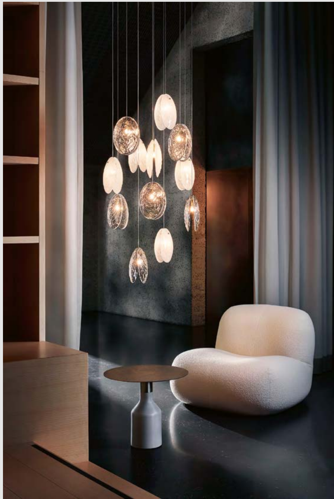
Mussels Collection installation of 12 pieces, Czechia, Kunsthalle Prague