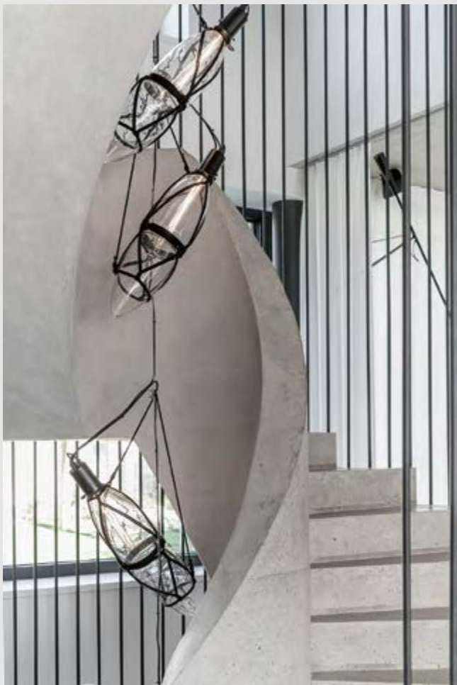
Tim Collection, Germany, BMK Yachthafen