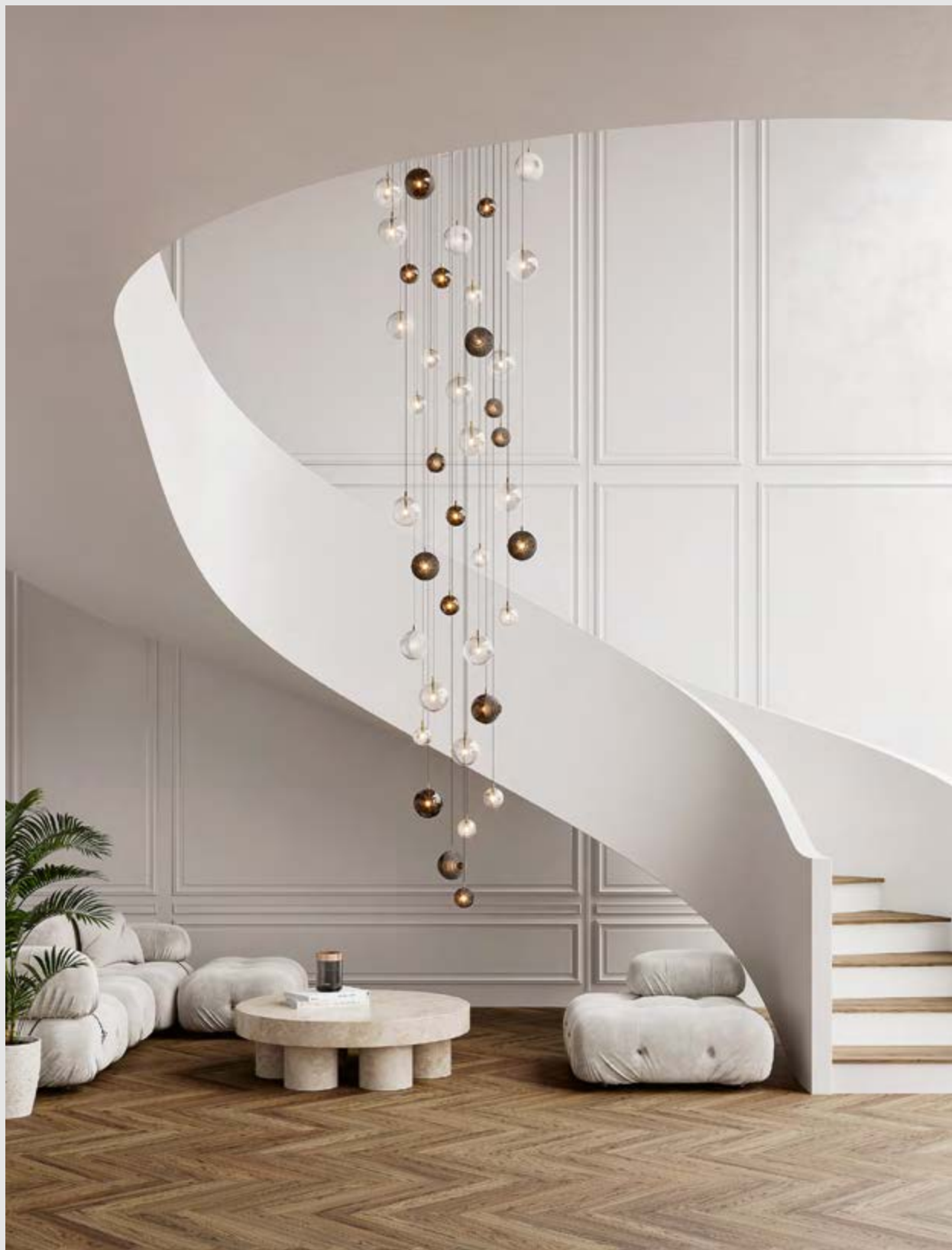
Dark & Bright Star installation of 88 pieces, Interior by AR Visual