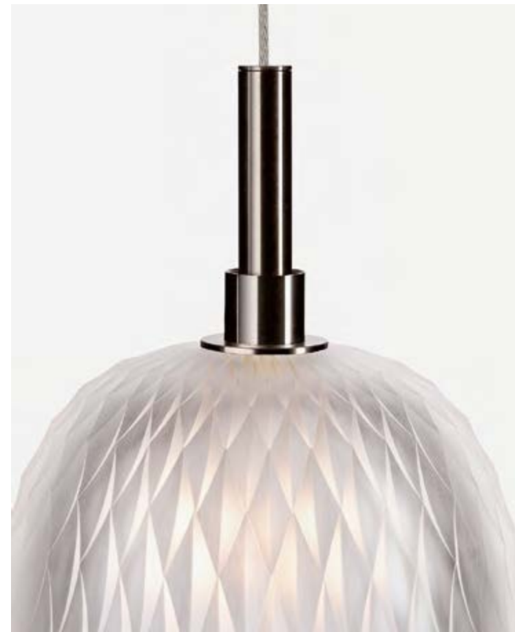
Glass Color: Amber, Clear, Cigar Mounting Finish: Anthracite, Brushed Gold