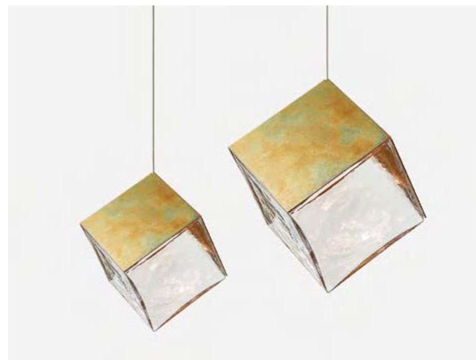
Glass Color: Clear Mounting Finish: DeOpale Brass