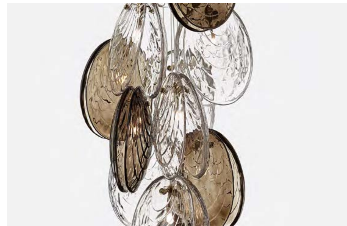
Glass Color: Clear, Alabaster, Dark Pearl, Pearl, Smoke Mounting Finish: Anthracite, Brushed Gold