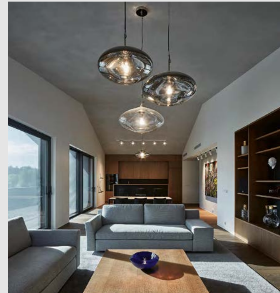
Disc Collection , Czechia, Tee House, Interior by CMC Architects