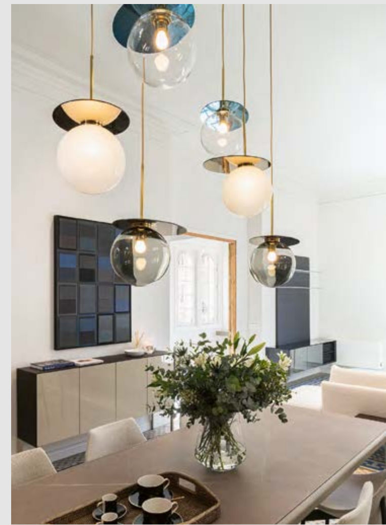
Dew Drops Collection , Interior by Monument Office