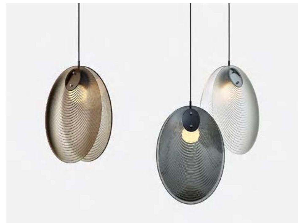
Glass Color: Clear Matte, Smoke, Bronze Matte Mounting Finish: Black