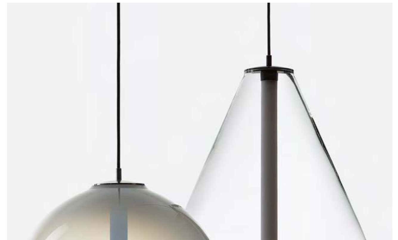
Glass Color: Clear, White, Smoke Mounting Finish: Black, Silver